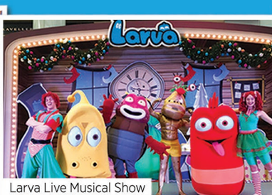
Larva Live Musical Show