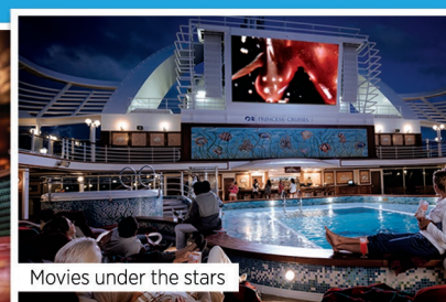
Movies under the stars